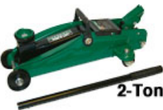
2-Ton Trolley Jack